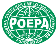
Pakistan Overseas Employment Promoters Association